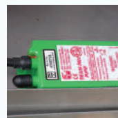
Condensate drain pump standard

Quick-connect hose fittings make installation a snap.