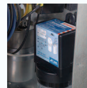
Hard start kit standard