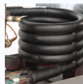
Coaxial condenser heat exchanger