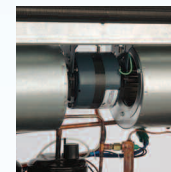
Dual evaporator fans for more even air distribution over the evaporator coil