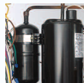
Compressor with standard accumulator... mounted on rubber feet for quieter operation